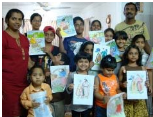
Children in the church had fun drawing and painting at the parsonage in October.

Meeting on Saturday 7th November At 7 PM